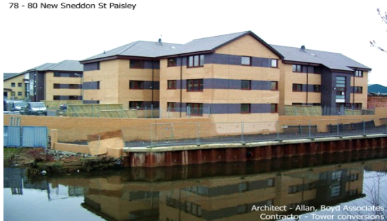
Architect - Allan Boyd Associates Contractor - Tower conversions